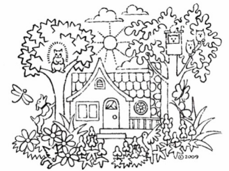
ROSEDALIAN • AUSTIN

In conjunction with this upgrade of the main wastewater lines, several private properties are having their private lateral lines relocated and are receiving new lateral service connections. Representatives from the City of Austin and Austin Underground are currently meeting with the property owners that will have their private lateral lines relocated. This project is scheduled to be completed by late fall.